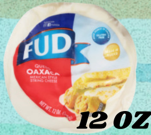
Oaxaca String Cheese