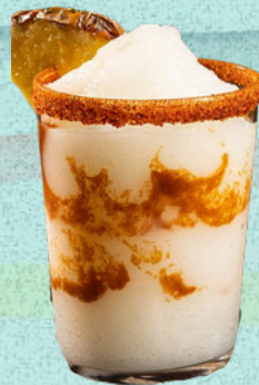
Pina Coladas Preparadas